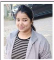
Khushboo Resource CoE