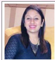
Puloma Sharad Resource CoE