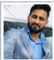
Siddharth Payroll CoE